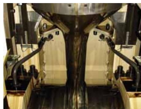
Bearing wear monitoring installation