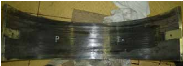
Fig. 1: Damaged bearing shell

Operation of the engine continued until the oil mist detector (OMD) alarm set off and requested slow-down. At this stage, the bearing damage had evolved into a situation where comprehensive repair of the crankshaft and bearing housing (bedplate) was called for.